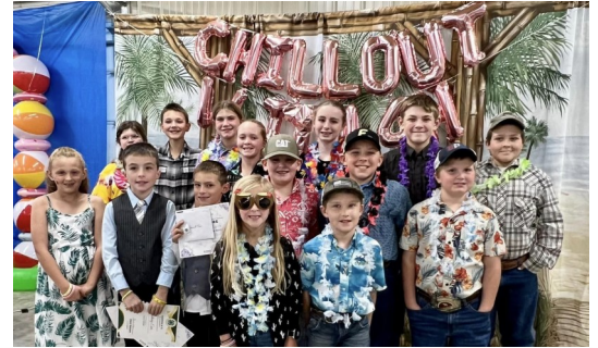
Above: Busy Beavers 4-H club at the awards banquet, after winning county project.