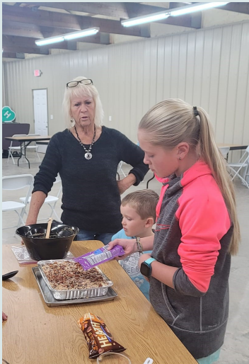
4-H members participated in Community Clovers with grandparents, and other adults in November to make Pumpkin Dump Cake.